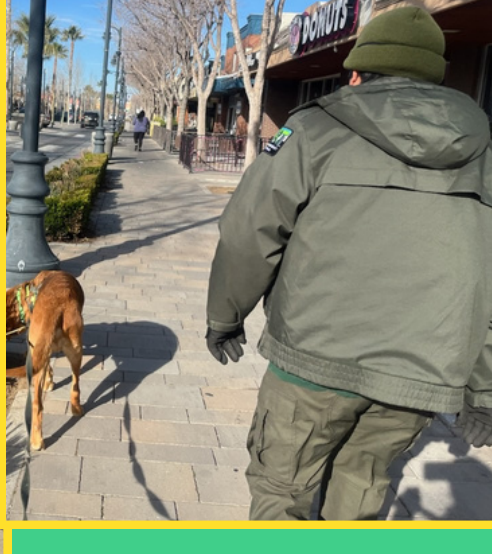
K9 Search and Rescue Exercise on Lancaster Blvd.